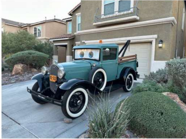
Need a tow?

SHOP HOURS: 9:00 AM - 12:00 PM MONDAY * WEDNESDAY * FRIDAY 5204 SEQUIN DR. LV 89130 Call: Del 702-553-8664