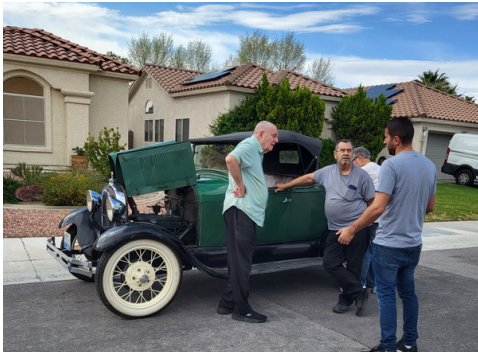
Dino getting checked out while visiting the shop.