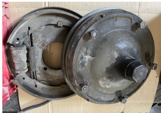
Set of 4 hydraulic brakes: $500