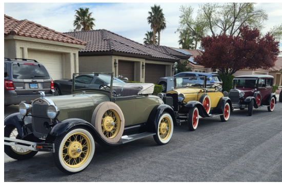
Looking like a busy Model A workshop day!