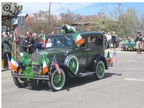
Chloride Saint Patrick's Day Celebration