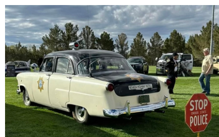
A few of the cars participating in the show.