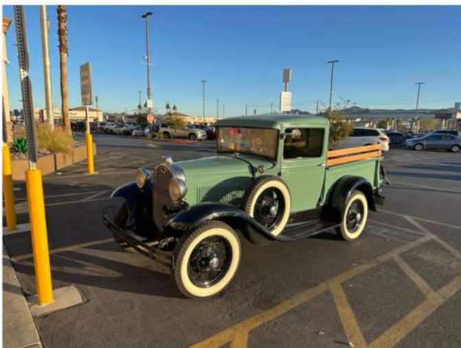
Mike McComb picking up a grocery order with the kiddos after going to the movies